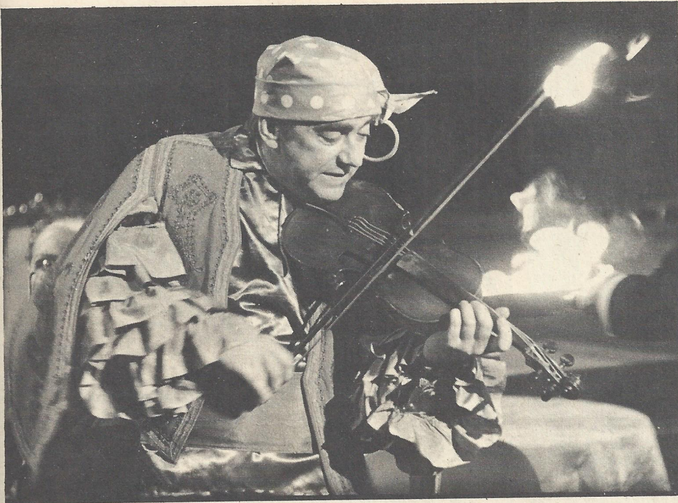
Light music at "Hancock's" is provided by the host, who is—as his staff unkindly say—an expert fiddler