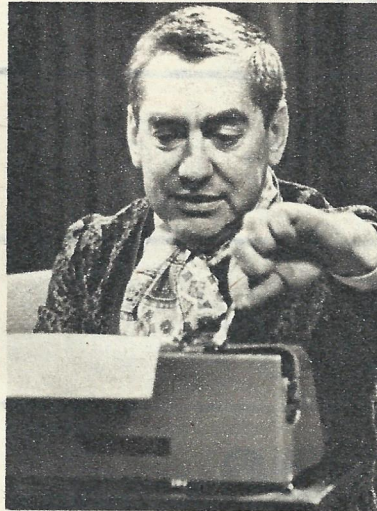
Dear Viewer, just a few lines to tell you my show is at a new time, 9.45 — Hancock